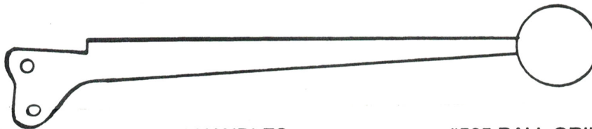
#504 HANDLES 2 REQUIRED